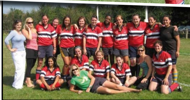
AWAY DAY: The Hammersmith & Fulham Rugby Ladies XV (left) had a game against Harlequins Ladies on the same day as the Hurlingham Park matches (above), but managed to make it back for the hog roast